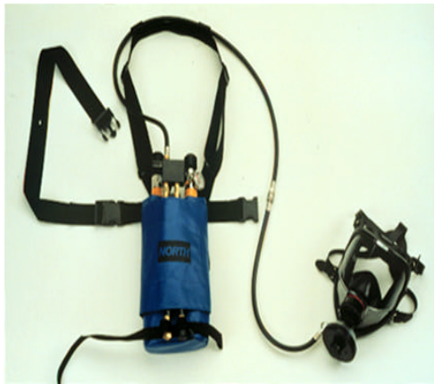
SAR with auxiliary SCBA.

# Combination full-facepiece pressure-demand supplied-air respirators with auxiliary selfcontained air supply.