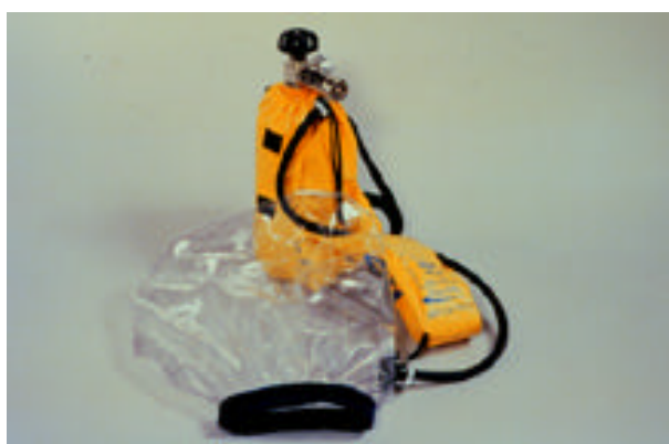
Emergency escape breathing apparatus

(d)(2)(iii) You must consider all oxygen-deficient atmospheres to be IDLH. Atmosphere-supplying respirators must be used in oxygen-deficient atmospheres (where oxygen is less than 19.5%). You may use any atmosphere-supplying respirator if you can demonstrate that, under all reasonable foreseeable conditions, the oxygen concentration in the work area can be maintained within the ranges specified in the following table (Table II of 29 CFR 1910.134). Otherwise, you must provide employees with full facepiece pressure demand SCBAs or combination full facepiece pressure demand supplied-air respirators with auxiliary self-contained air supply.