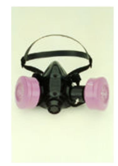
Facepiece with fit test adapter inserted