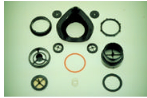
Inspection of SCBA nosecup

# Emergency escape-only equipment. Before being carried into the workplace for use.