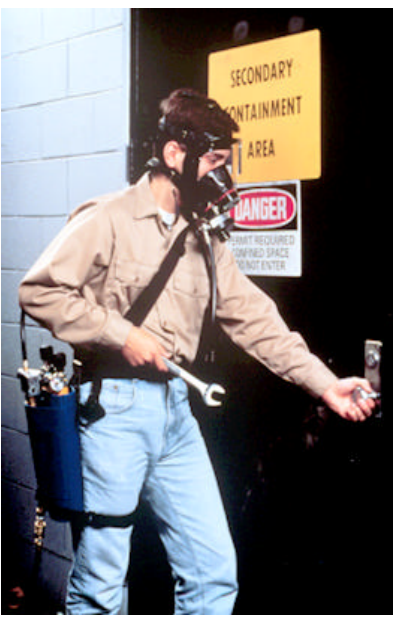
SAR with auxiliary SCBA.