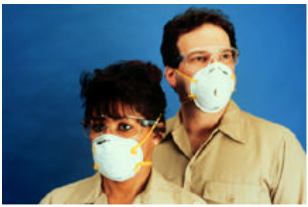
Particulate APR, N95

See the sources of help section at the end of this chapter for advice and information in determining whether or not contaminants in your workplace consist primarily of particles of two micrometers or more.