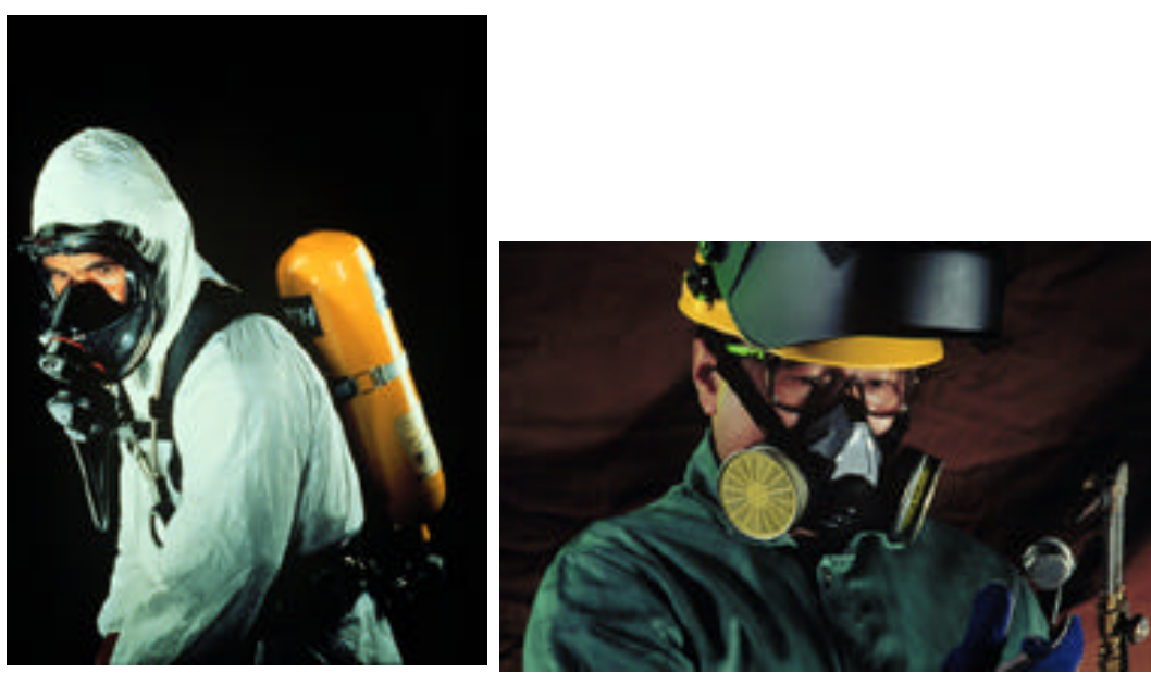
Atmosphere supplying respirator