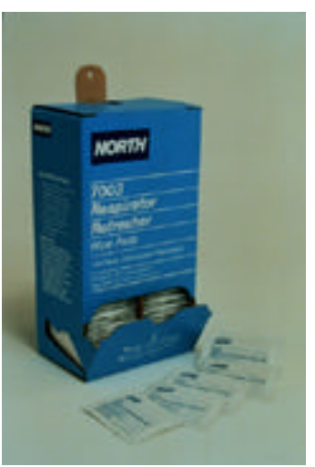
Respirator wipes are useful for cleaning

environment will require that the respirator facepiece, in particular, be cleaned more frequently.